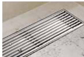
Chrome channel drain