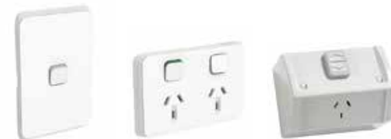
Iconic Vivid cover plates and switch plates