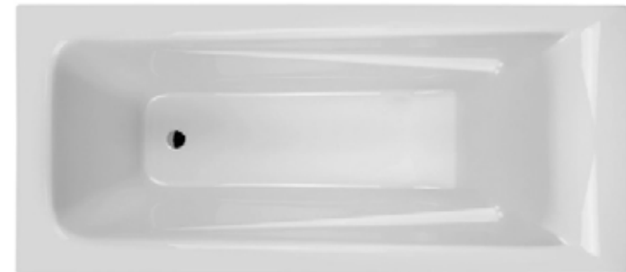
Decina Novara bath