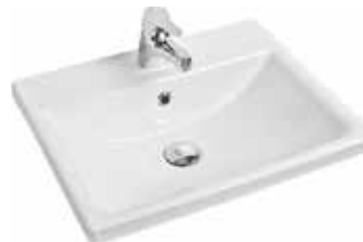
Argent Zen basin