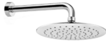
Argent Pallas overhead and Essentials arm