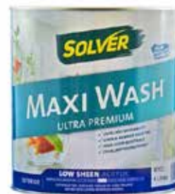
2 coats Solver Maxiwash low sheen