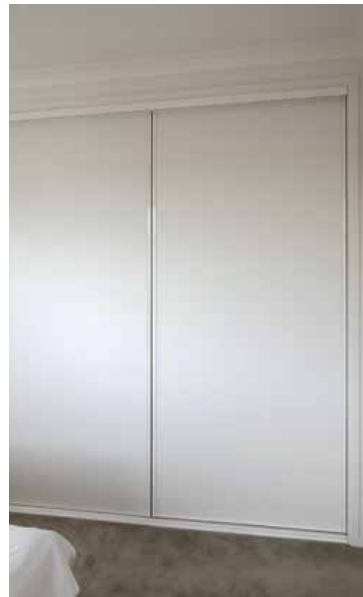
Built in sliding robe