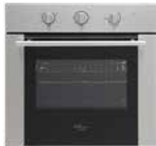
Euro 600mm electric oven