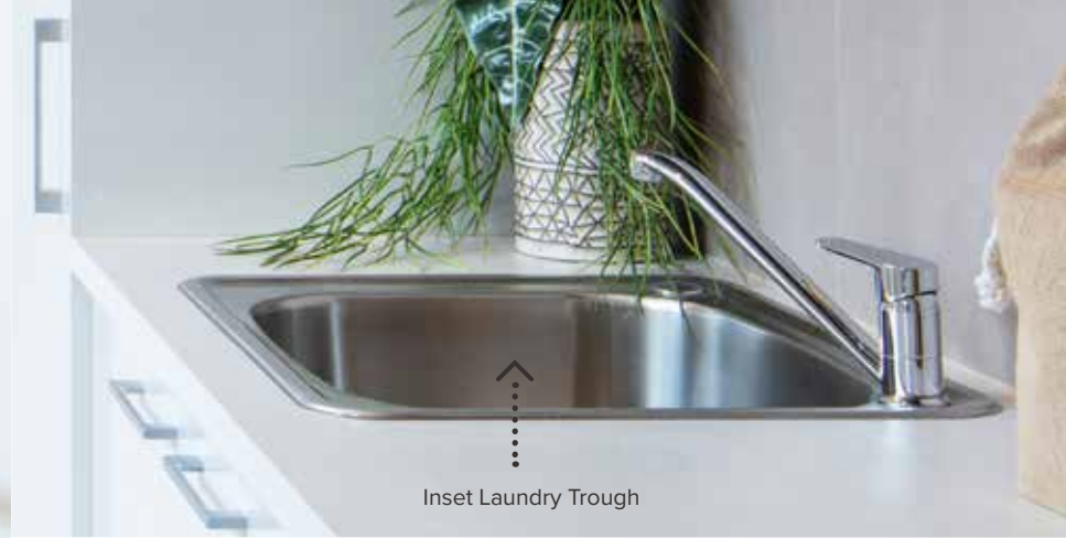
Inset Laundry Trough