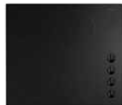
Euro 600mm ceramic cooktop