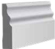
67 x 18mm Colonial skirting