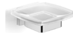
Argent Line soap dish