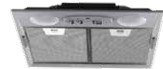
Westinghouse 520mm undermount rangehood