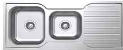
Format Main stainless steel sink