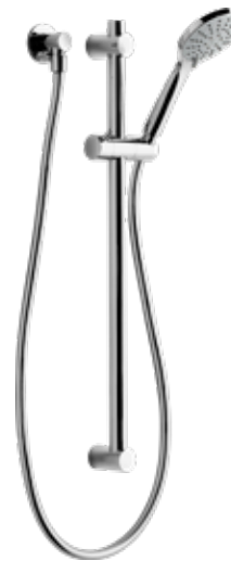
Argent Metro shower rail