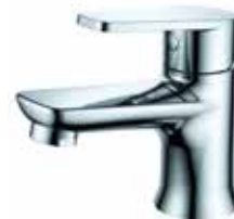
Eura basin mixer