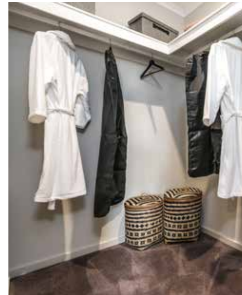
Walk in robe