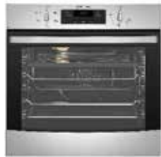
Westinghouse 600mm electric oven