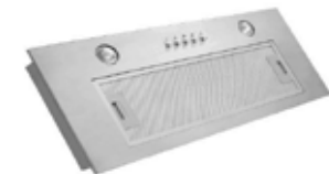
Euro 900mm undermount rangehood