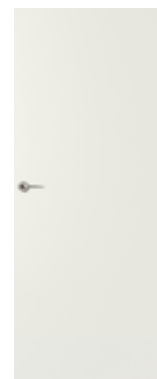
Flush panel 'Readicote'