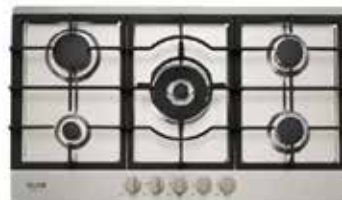
Euro 900mm gas cooktop