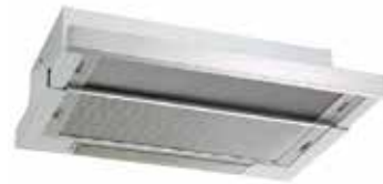
Westinghouse 600mm slideout rangehood