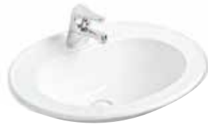
Argent Azure basin