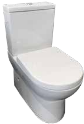
Argent Pace toilet suite