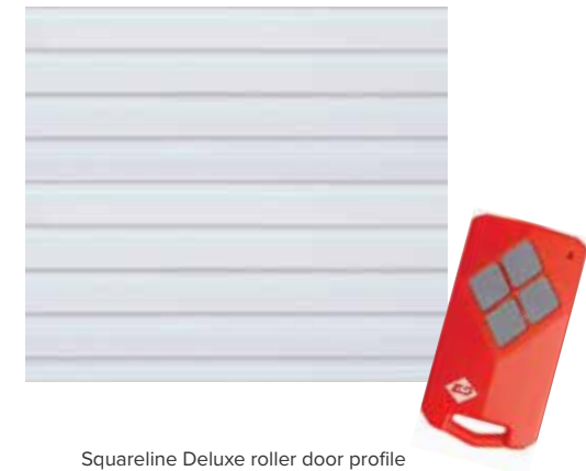
Squareline Deluxe roller door profile