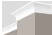
90mm Cove cornice