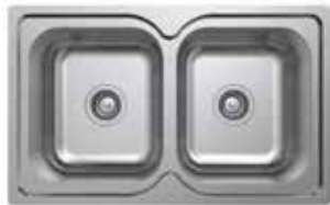
Format Double Bowl stainless steel sink