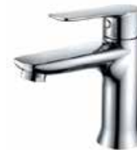
Axa basin mixer