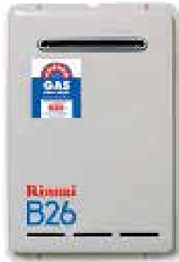
Rinnai Instantaneous hot water system