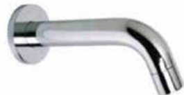
Argent Curve bath spout