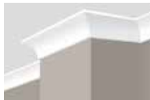
55mm Cove cornice