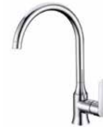
Argent Axa sink mixer