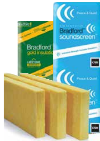
SoundScreen & Gold insulation