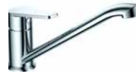
Argent Eura sink mixer