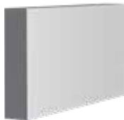
67 x 18mm SA Square Dressed