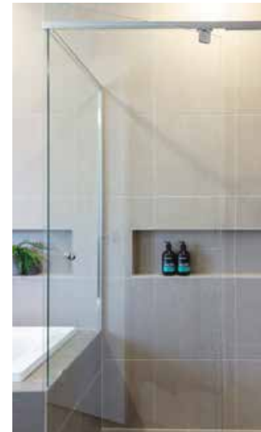
Aqua Deluxe shower screen