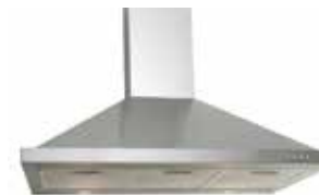
Euro 900mm canopy rangehood